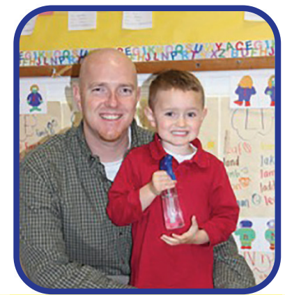
"The educational foundation that the boys have gained will be a tremendous asset as they continue to grow."